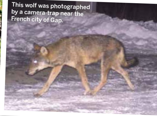
This wolf was photographed by a camera-trap near the French city of Gap.

The estimated number of wolves in Europe, excluding Belarus, Russia and Ukraine, spread between 28 countries. This figure is roughly twice the wolf population of the lower 48 states of the USA.