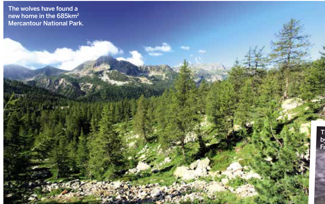
The wolves have found a new home in the 685km 2 Mercantour National Park.