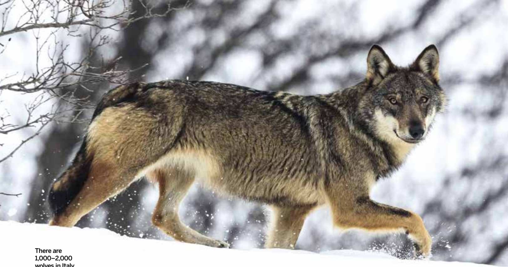
There are 1,000–2,000 wolves in Italy.