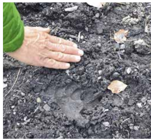
Right: the tour operator Undiscovered Alps runs trips to track wolves. Far right: in 2015 farmer Pierrot Samuel lost 25 sheep to wolf attacks.

In 2014 there were a reported 8,576 sheep and other livestock killed by wolves; the French authorities now operate a